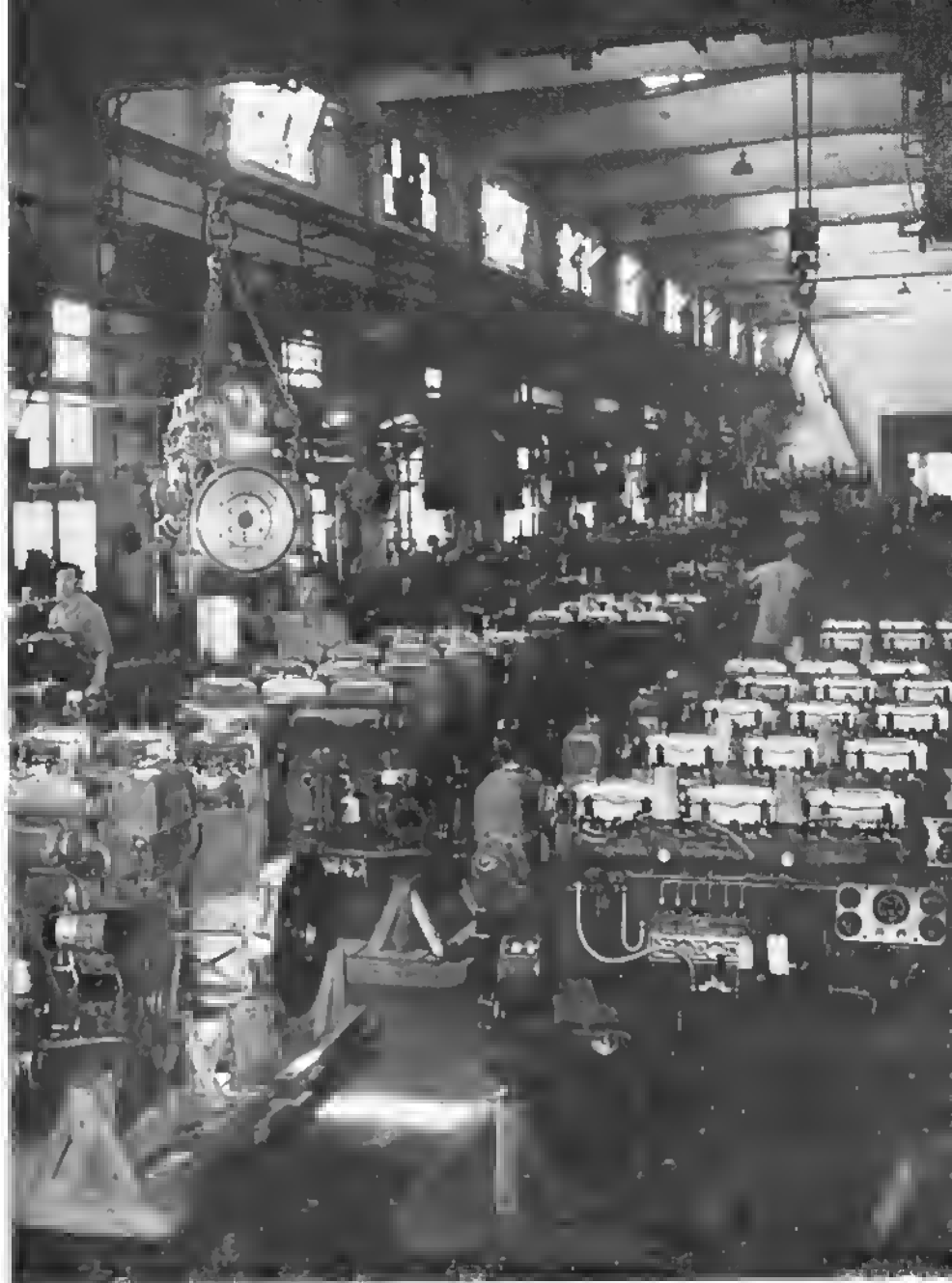
Diesel engines ready for shipment — Shanghai Diesel Engine Plant.

With the completion of the land reform, the poor and lower-middle peasants were freed from the feudal landlords' oppression and became masters of their land. Guided by Chairman Mao they organized mutual-aid teams. In an effort to wrest higher yields from the land, they started a mass movement to improve farm tools. Between 1953 and 1957 mutual-aid teams changed to semi-socialist and then to fully-socialist cooperatives. With land and man-